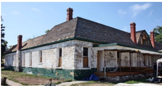
Administration Building 2009

It is really exciting to report that the renovation of the old Administration Building has been completed. Currently, the members of Fort Stanton Inc. are moving all the contents of the small museum as well as many items in storage into this beautifully renovated building. They expect to have the new Museum up and running by April 1. So those of you who live locally can get over there and see the results of this long and slow process. You can see what a wonderful place it is now and you'll enjoy viewing new/old things there. Renovations are also proceeding on Bldg. 13. The website has photos and information about these changes.