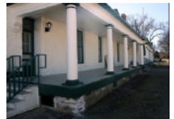
Administration Bldg Exterior 2010